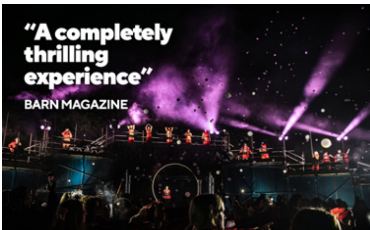
Olion review (Nov 2024)